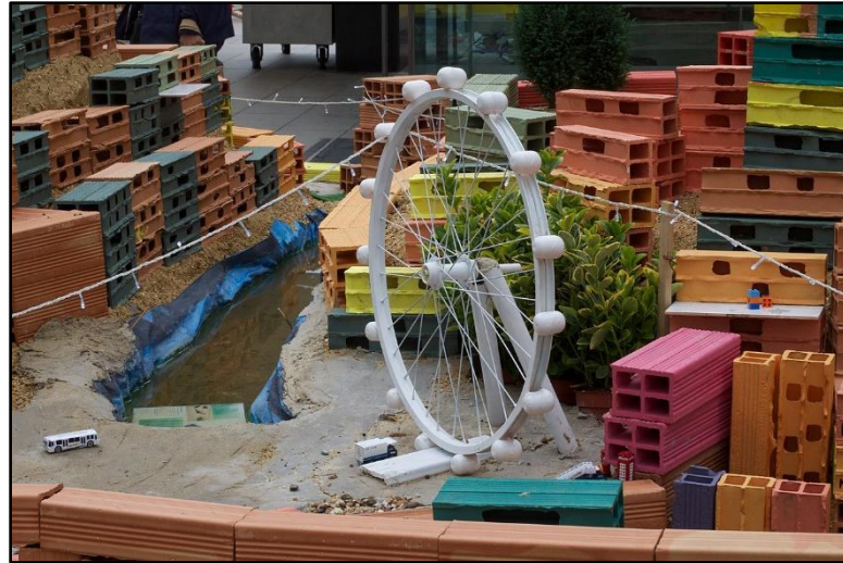
Photo: A city model as part of Project Morrinho, Rio de Janeiro, Brazil

This project provides opportunities to use critical thinking skills, learn about urban planning, practice the design process, and develop stronger cognitive skills. The user designs and builds each individual element of a town and engages in problem solving with limited resources (materials). Users draw on their prior knowledge and experiences while expressing their own creativity. With its initial emphasis on brainstorming, this project gives users the experience of sharing their ideas and listening to the ideas of others. This process is a real hands-on approach to working with peers and enhancing communication skills.